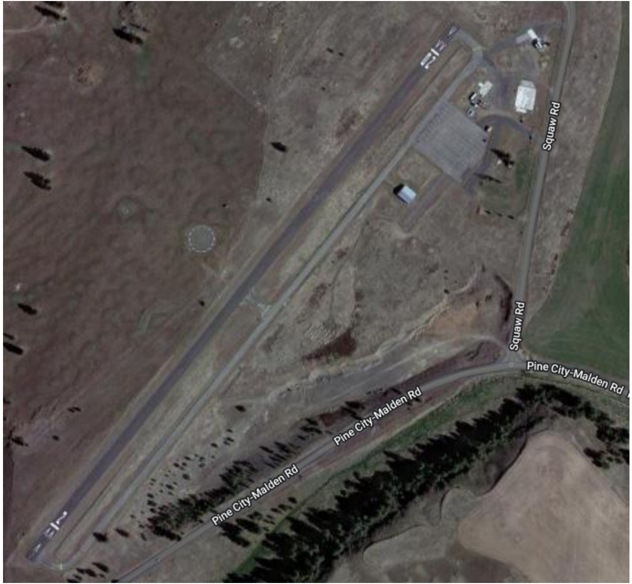
Figure 3. Rosalia Municipal Airport Satellite Map